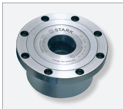
SPEEDY airtec , size Ø 105 mm