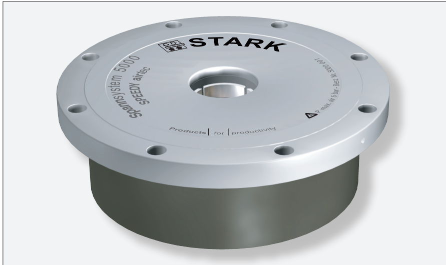
SPEEDY airtec - locks mechanically, releases pneumatically