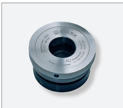
SPEEDY airtec , size Ø 80 mm