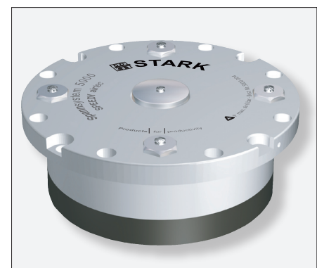
SPEEDY airtec , size Ø 155 mm, with central locking, mounts and index bores