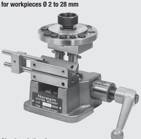
Size 0 variation A with V-block and index drilling disc